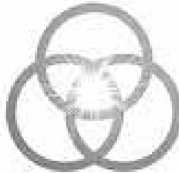
The Trinitarian Knot: A Symbol of the Holy Trinity