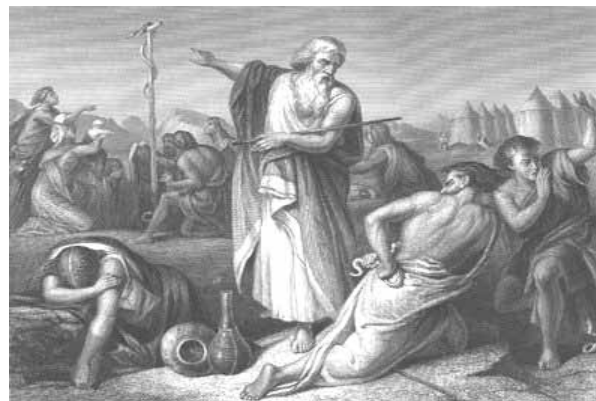
Moses and the Bronze Serpent

Serpent : In the Book of Numbers , Moses mounts a bronze serpent on a staff and uses it to cure those afflicted with snakebites. Here John compares this to the crucifixion of Jesus and the salvation it will win for us.