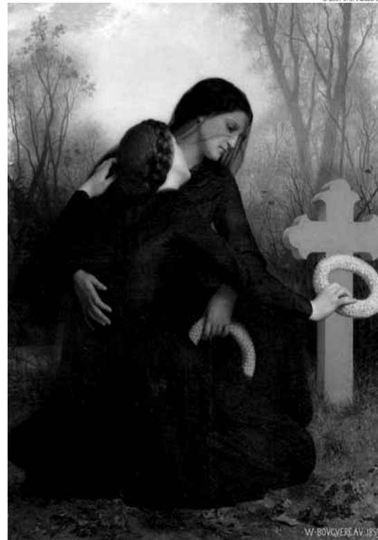
"All Souls Day" by William-Adolphe Bouguereau